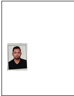
Too Small X