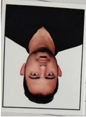
Inverse Photo X