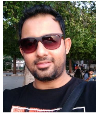
With Goggles X