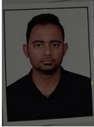
Too Dark X